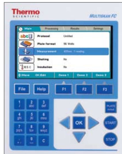
Large color screen and visual internal software

Applications: Immunoassays (ELISA), Protein assays, Endotoxins, Cytotoxicity and proliferation assays, Enzyme assays, Endotoxins, Growth curves